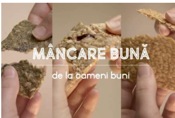
Good Food from Good People